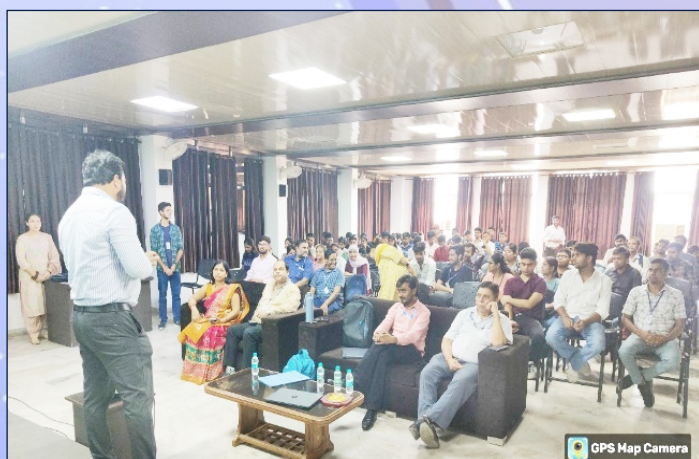
Faculties and Students attending the Workshop