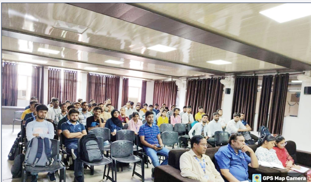
Glimpses of IDEATHON